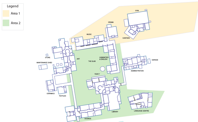
Churchill Campus Yard Duty