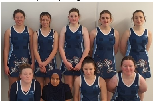
Students participating in Interschool Netball and Soccer in July