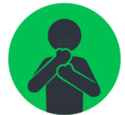
Sore Throat or Cough